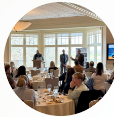
Business Lunch Series