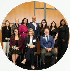
Ovation Awards (held in 2024)

KABA hosts events throughout the year to inform and engage its investors and the Kenosha community about topics central to moving the county forward. Some of the programs include business lunches on timely topics, candidate forums, an annual meeting, a business recognition dinner, an annual leadership conference, and many more. We also collaborate with partners to present programming on an as-needed basis including specialized economic development training, ribbon cuttings, familiarization tours, roundtable discussions, and much more.