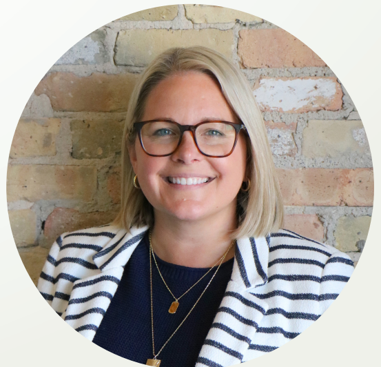
President, Kenosha Area Business Alliance

Best wishes for a happy and prosperous 2024,