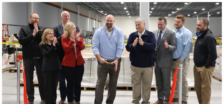
In 2023, KABA provided $1.2 million in funding to support a 50,000 SF facility and equipment expansion at LMI Packaging Solutions.