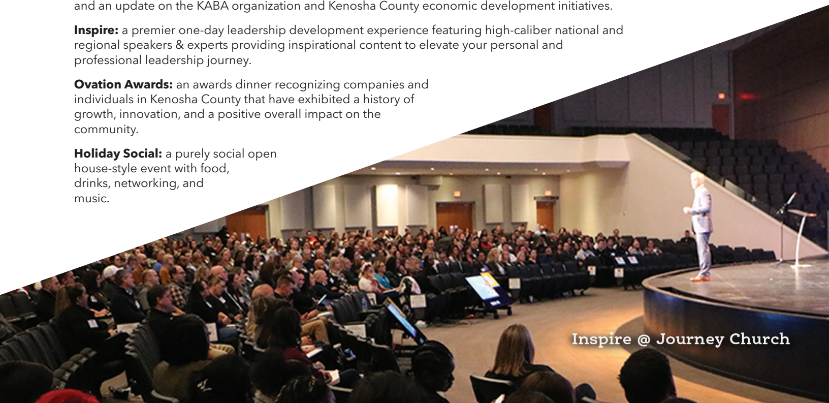
Inspire @ Journey Church

Holiday Social: a purely social open house-style event with food, drinks, networking, and music.