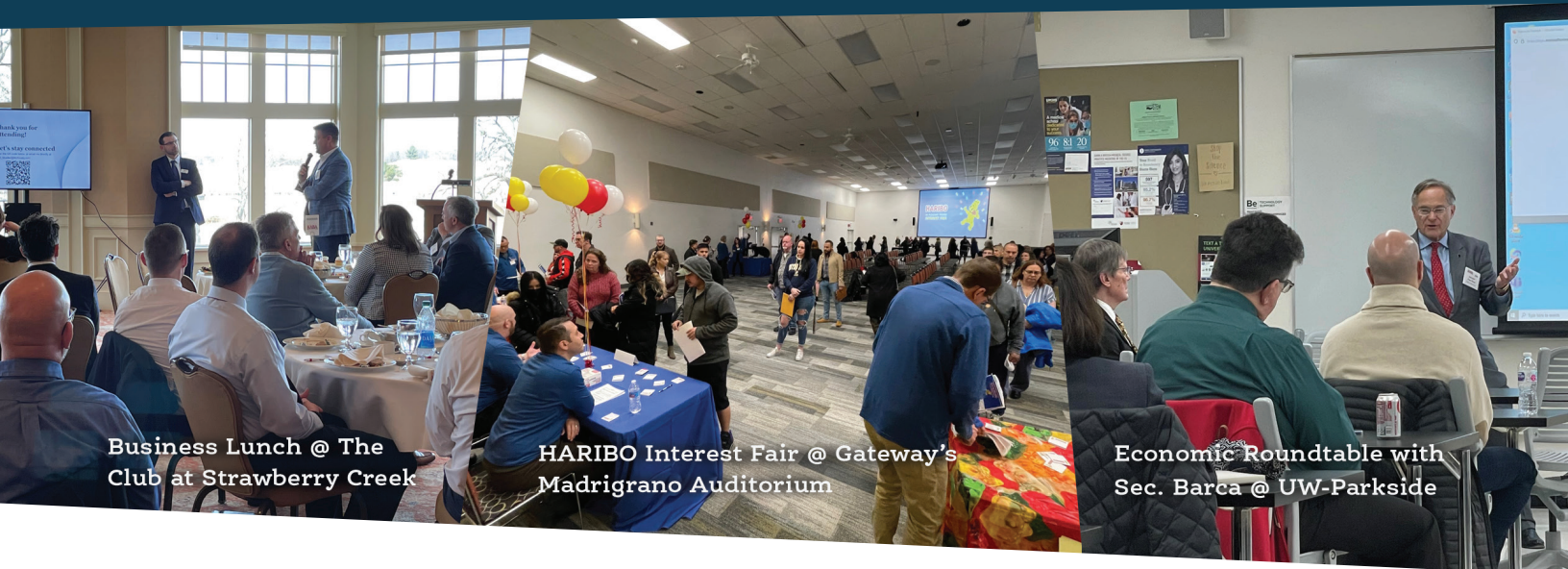
Business Lunch @ The Club at Strawberry Creek