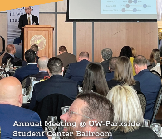
Annual Meeting @ UW-Parkside Student Center Ballroom