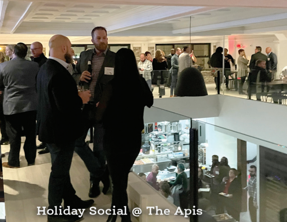
Holiday Social @ The Apis