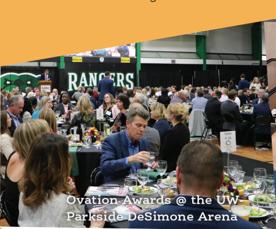
Ovation Awards @ the UW Parkside DeSimone Arena