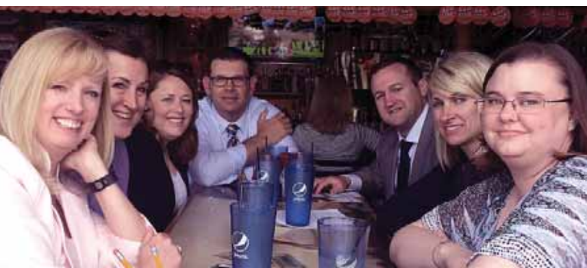
STAFF (clockwise left to right)