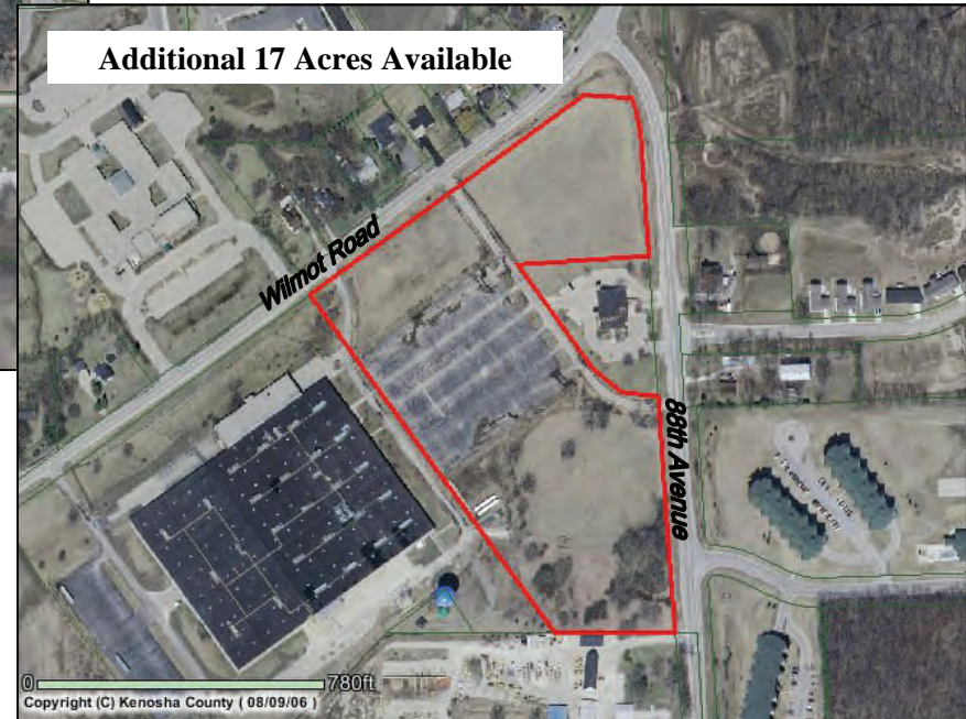
Additional 17 Acres Available