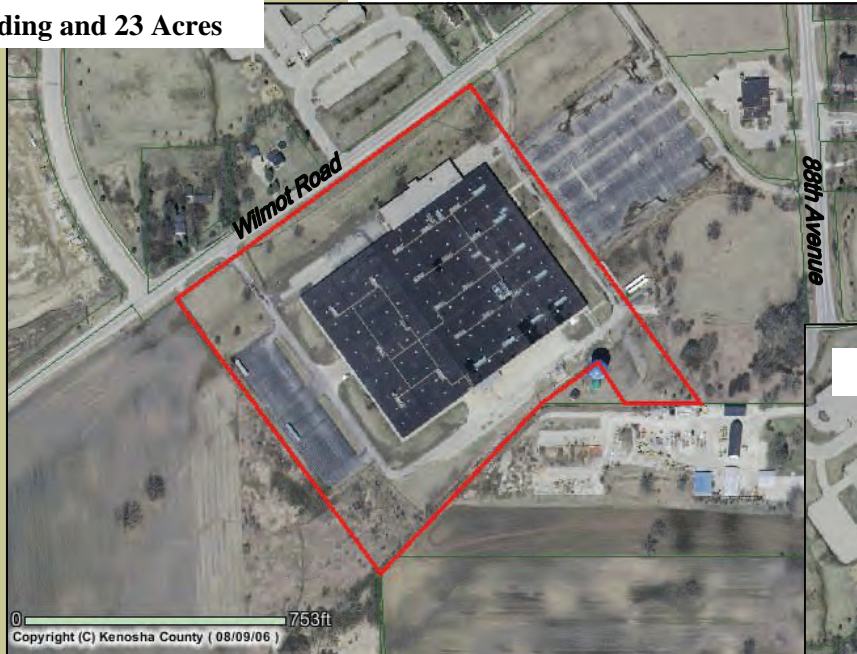
Building and 23 Acres